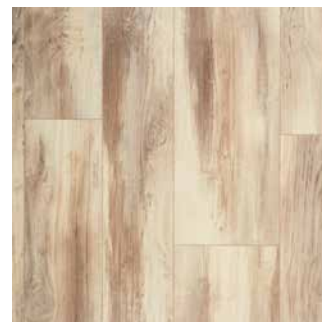
4308-468 | 2m | 4m |