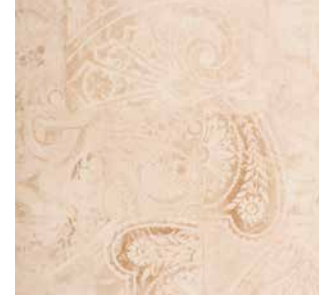
4305-470 | 2m | 4m |