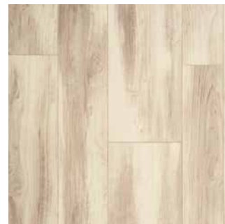
4308-456 | 2m | 4m |