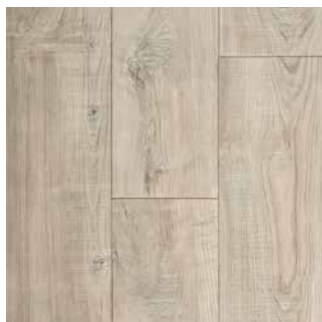
4311-472 | 2m | 4m |