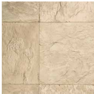
4247-484 | 2m | 4m |