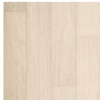
4259-482 | 2m | 4m |