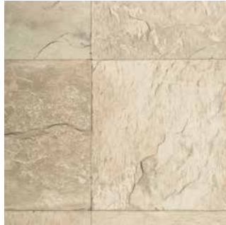
4247-483 | 2m | 4m |