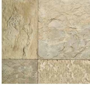
4247-482 | 2m | 4m |