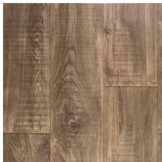
4311-470 | 2m | 4m |