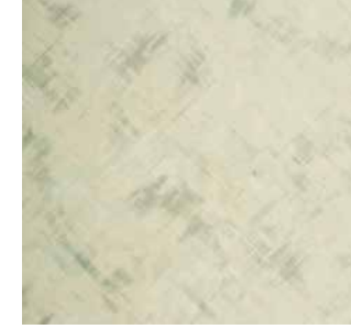
4277-492 | 2m | 4m |