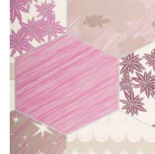
4301-465 | 2m | 4m |