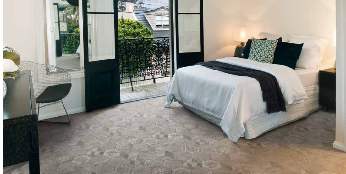
4299-480 | 2m | 4m |