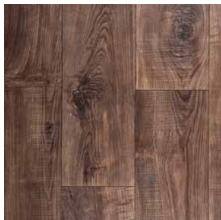
4311-471 | 2m | 4m |