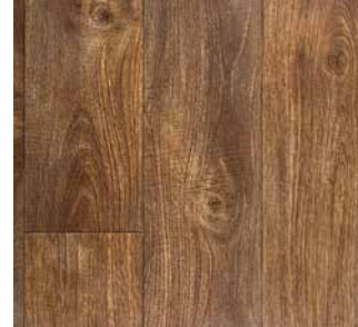
4304-467 | 2m | 4m |