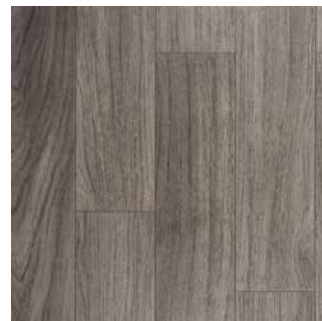
4259-483 | 2m | 4m |