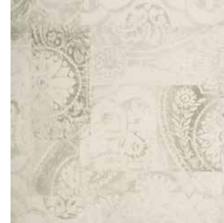
4305-471 | 2m | 4m |