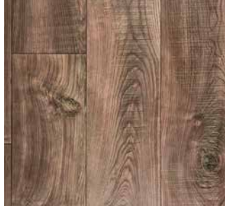
4311-469 | 2m | 4m |