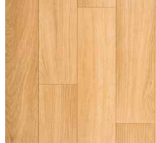
4259-481 | 2m | 4m |