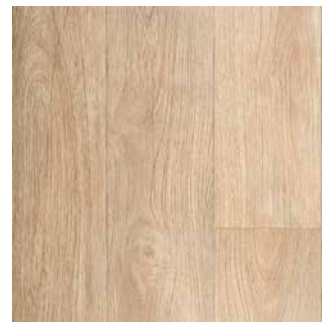
4304-473 | 2m | 4m |