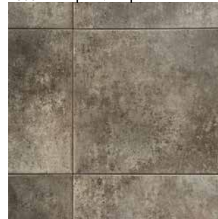
4306-470 | 2m | 4m |